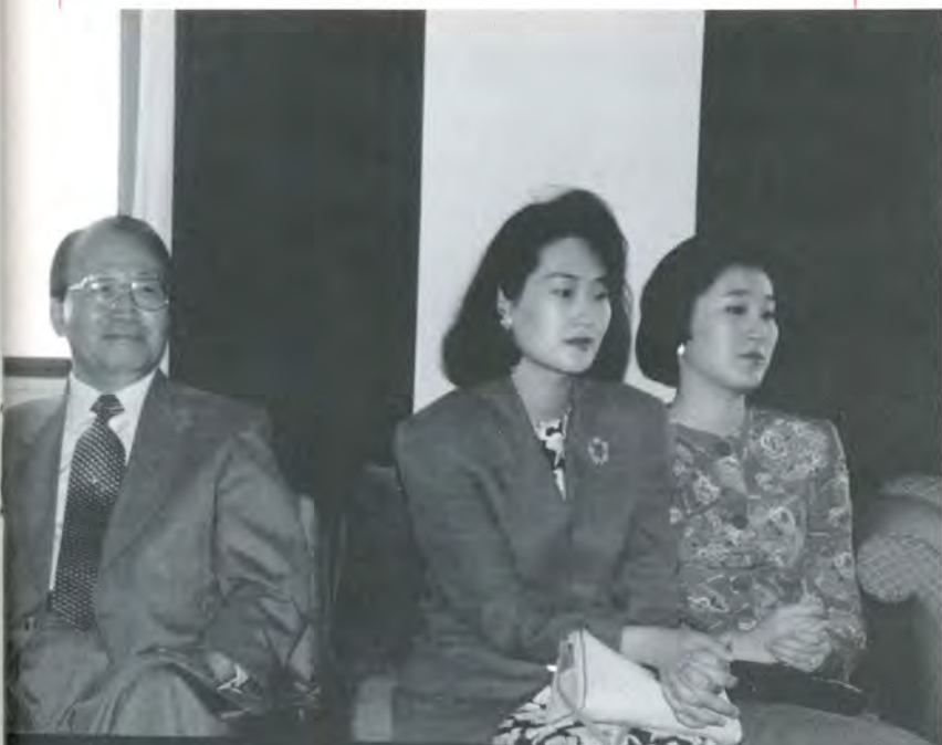
Philadelphia, Pennsylvania, May 29, 1993

just for Koreans, not just for Americans, but for all humanity. For over twenty years Father has been teaching you every single day. You have studied Father's teaching, Father has been taking care of you, and you have been living with Father, but