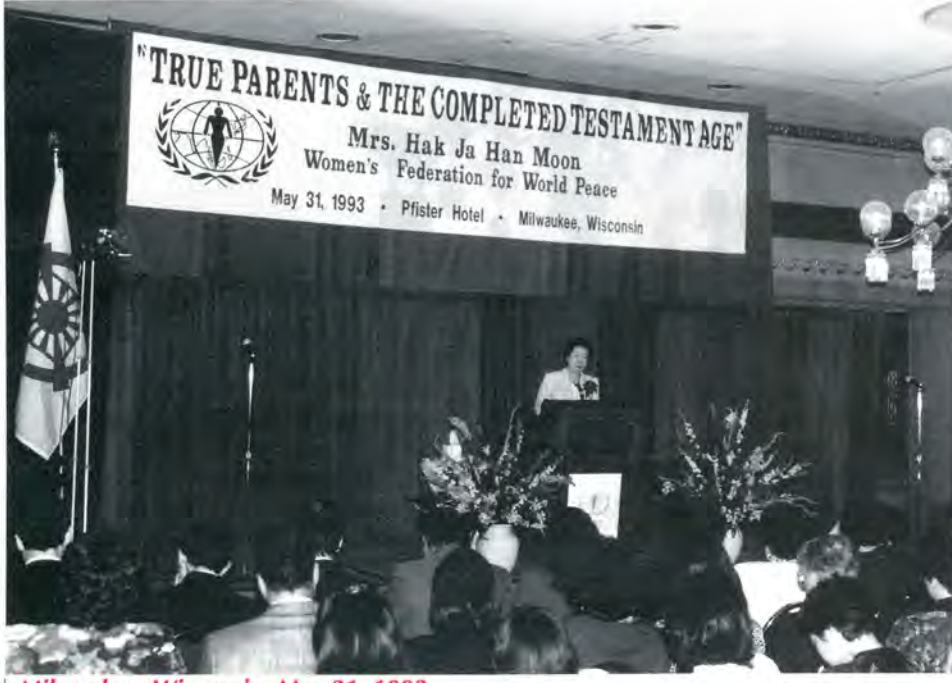
Milwaukee, Wisconsin, May 31, 1993

place in Charlotte, North Carolina, on June 27. After pledge service, Mother declared, "There is hope for America." She cited two examples of Christian leaders uniting with True Parents: