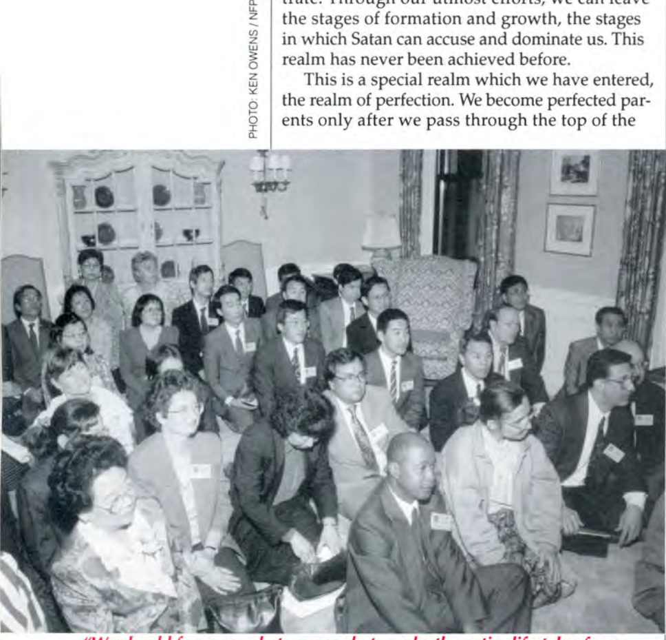
"We should focus on what we can do to make the entire lifestyle of our blessed family reflect God. That is the essence of the Completed Testament Age and must be our primary concern." Members from Region 5, headquartered in Chicago, Illinois, participate in the victory celebration after Father's speech in Chicago.

Why have believers in general experienced hope by waiting for the Lord, a new heaven and earth and a new providence, until today? Because there is incredible joy in the expectation of entering the beautiful, final world, the heaven that God promised. The believers' hearts are filled with the desire to meet the Lord. Just meeting the Lord makes everything worthwhile. If they meet the Lord, all things are resolved; all the complicated circumstances and sins are solved at one time and he becomes the center of the new heaven and