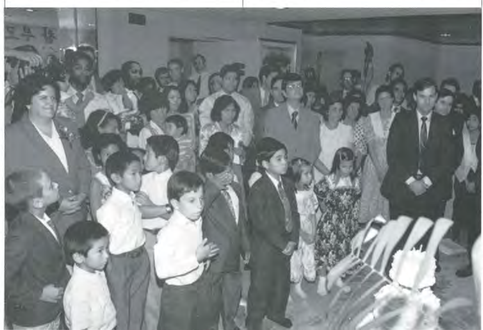
New Orleans, Louisiana, June 4, 1993

Throughout her tour, Mother channeled to us God's shimjung about human-