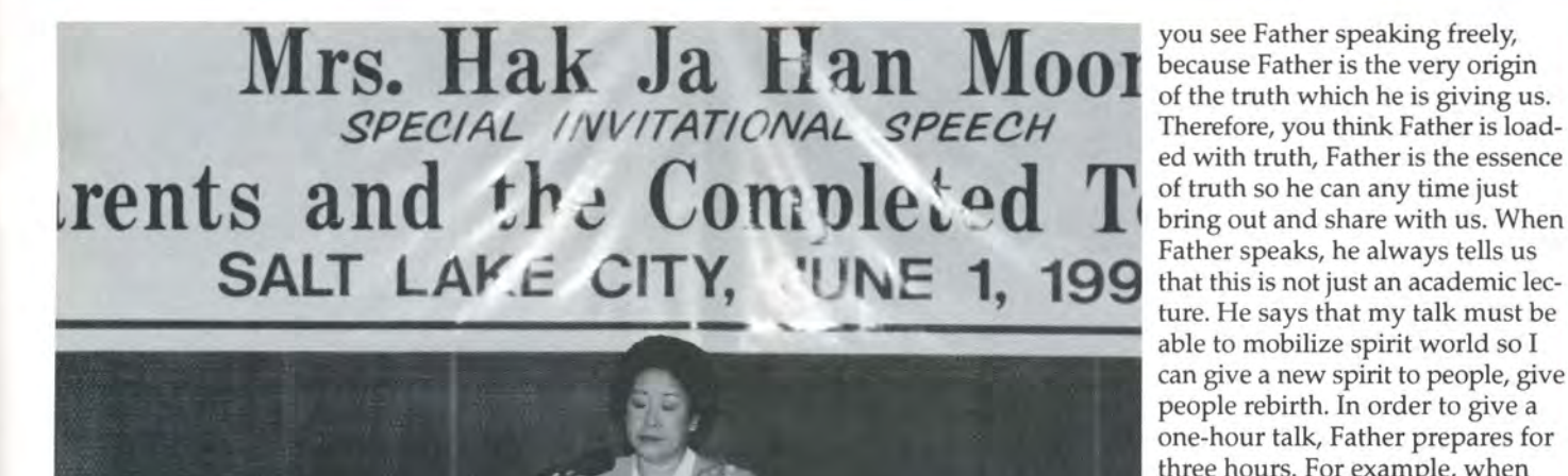
Salt Lake City, Utah, June 1, 1993

It is good to answer yes. Your result will be your answer, so please have a serious attitude about accomplishing this goal and live a serious life so you can accomplish your work.