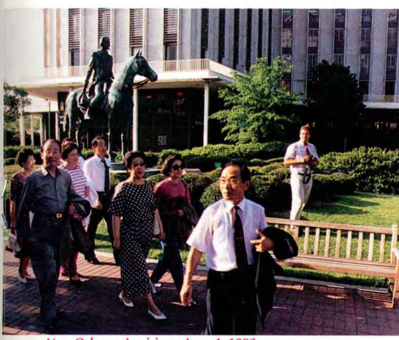
New Orleans, Louisiana, June 4, 1993

Hope that we can all reach the place of God's blessing.