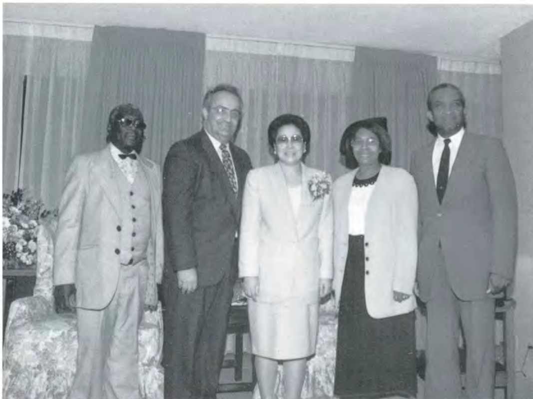
New Haven, Connecticut, May 27, 1993

Every detail of your entire physical life will be reflected in the spirit world, just like on a microfilm. The spirit world is a world of love.