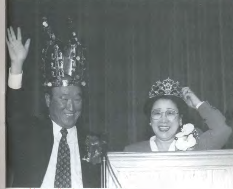
Chicago, Illinois, May 17, 1993

Here is the son who came to this land alone twenty-eight years ago and founded the holy ground at these Twin Peaks. I was thinking of Your tearful children who were going the suffering path while no one was aware of it. Some disciples faded away from this path with lamenting sighs and took the opposite course, persecuting me. There are many who lost the way in confusion and don't know which way to turn to escape the opposite side and their regretful situation. Father! I dare ask You to have a generous heart toward those pitiful people so they