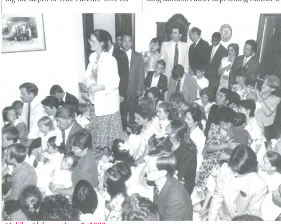
Mobile, Alabama, June 5, 1993

I thought that although the suffering in their family has been the greatest, the true love in their family is the sweetest of all and is their personal gift from God. Our challenge is to change our lifestyle to achieve this level of heart as individuals and families while on earth.