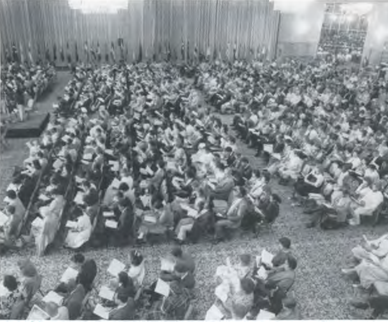
Washington, D.C., May 15, 1993

Oh, pitiful tribes of Israel scattered all over the world, myriads of miserable Christians, and opposing people who are ignorant of this great era! Father! Please let all those people be connected to the rope of True Parents' love centering upon the bond of brotherhood. Looking at the painful corrupt reality, I feel