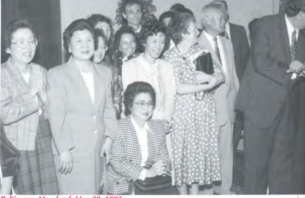
Baltimore, Maryland, May 28, 1993

world of love. Therefore, if you can't establish the bonds of love with True Parents and the foundation of total unity with True Parents in this world, imagine what kind of position you will have in the spirit world. When you join the spirit world, the first condition by which you will be evaluated as children of True Parents is how much you loved True Parents. The second condition is how much love you offered to your neighbors, to