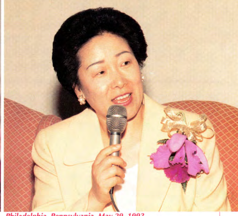
Philadelphia, Pennsylvania, May 29, 1993

E may forget other things, but we must understand this one thing, that God spent more than six thousand years of the history of restoration to find the True Parents, and True Parents have shed tears and blood and sweat all throughout their lives. Upon that victorious foundation of suffering, pain and persecution, now True Parents can proclaim to the world True Parenthood, the Messiah and this new Completed Testament Era. We must remember that this kind of joy must not be hoarded. We cannot be the only ones who feel this kind of joy and happiness. Father and Mother fulfilled the ideal family. Now you are living together with True