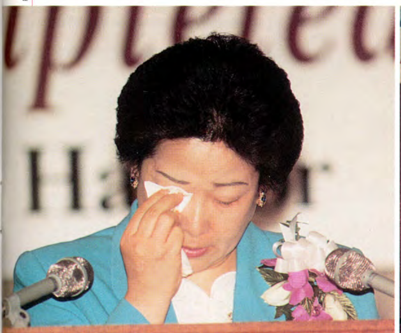
Baltimore, Maryland, May 28, 1993

The same principle applies to you. Who among you is willing to have sleepless nights in order to spread this truth and bless-