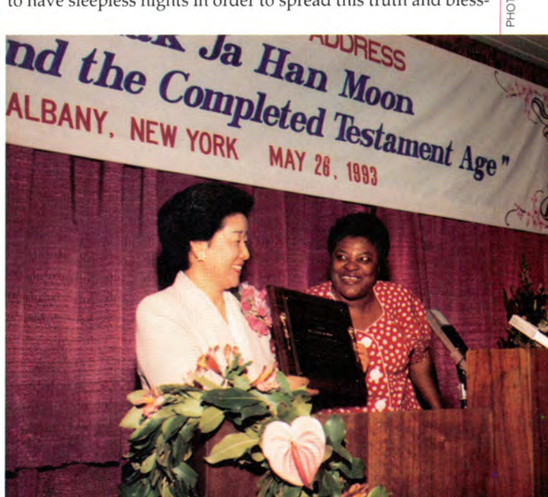
Albany, New York, May 26, 1993