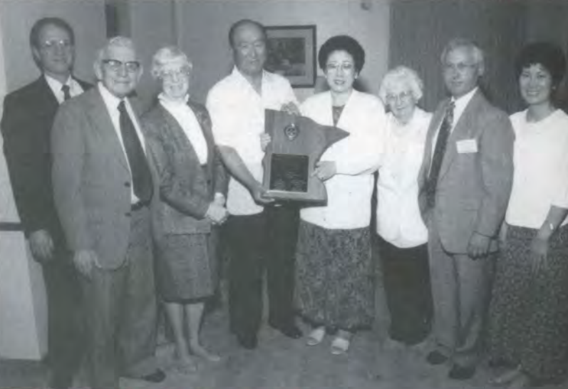
Minneapolis, Minnesota, May 18, 1993

Heavenly Father! I desperately ask You to give more power and blessing to those who care for the Unification Church with their whole heart, those who think of me—the core of the Unifi-