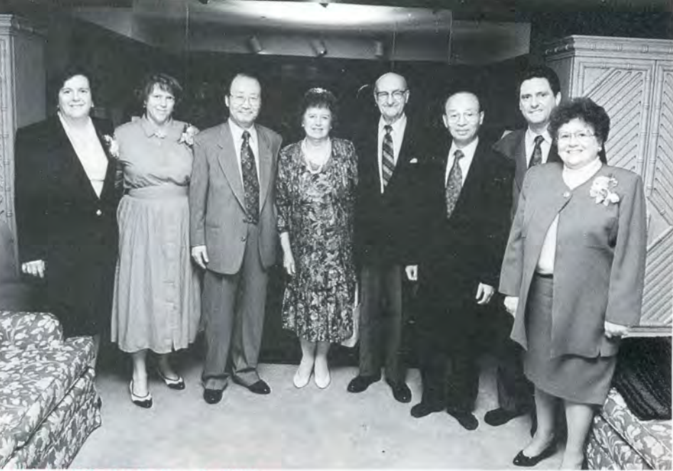
Salt Lake City, Utah, June 1, 1993

If Father is leading that kind of life, what do you think you have to do? You have to do maybe ten times more than Father, a hundred times more than Father. You haven't done it up to this point. Can you live up to the expectations of your Father and Mother?