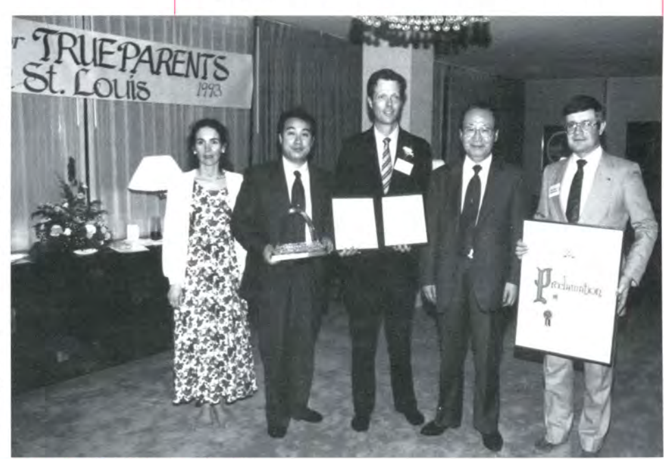
St. Louis, Missouri, May 30, 1993

When you are trying to witness to somebody, instead of just praying and going out to talk to that person, have a dis-