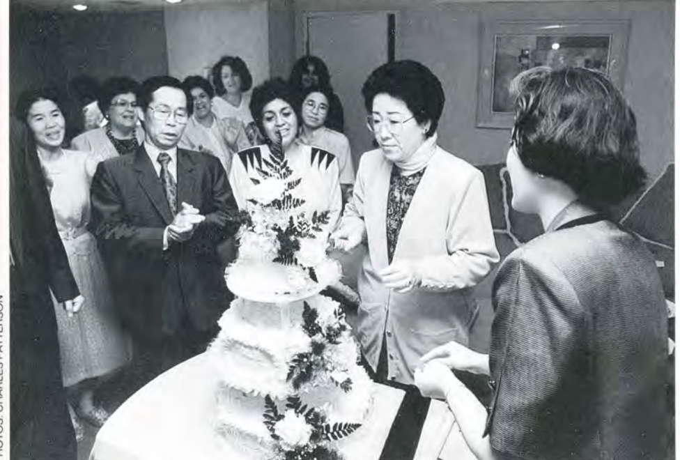
San Diego, California, June 2, 1993

state's geography. She said that Kansas is in the center of the United States and, therefore, is like the heart, playing a central role in maintaining life. She called upon Kansas to play a major role in the dispensation of America.