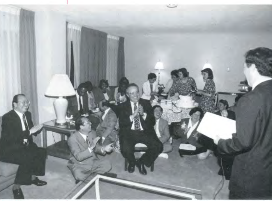
New Haven, Connecticut, May 27, 1993

We must understand that Father is in that kind of position and that God's heart is reaching out to comfort Father.